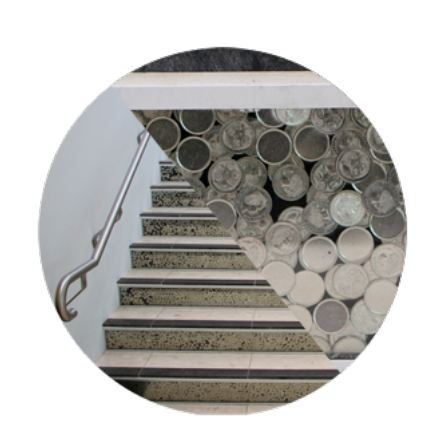
The Mint staircase